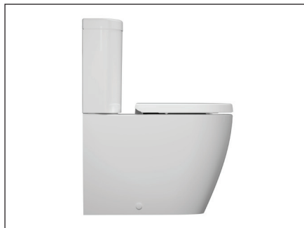
Back entry version of pan pictured